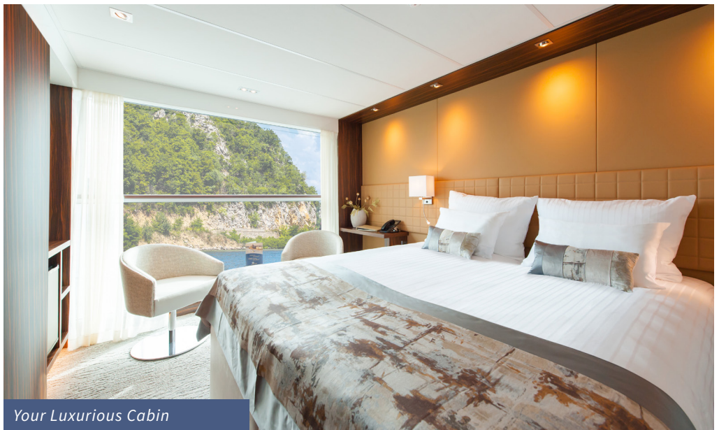
Your Luxurious Cabin

LEGEND: ( ) = Included meal, B = Breakfast, L = Lunch, D = Dinner