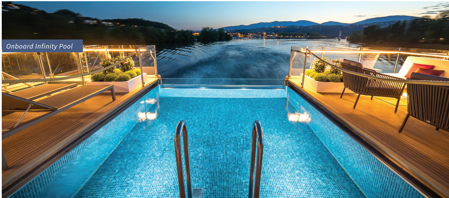
Onboard Infinity Pool