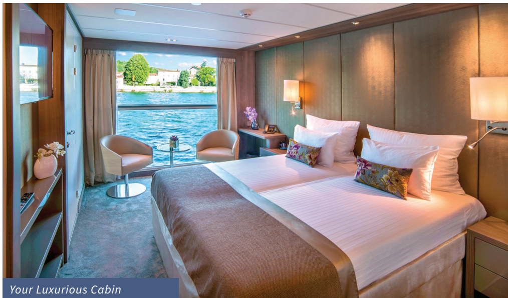
Your Luxurious Cabin

LEGEND: ( ) = Included meal, B = Breakfast, L = Lunch, D = Dinner