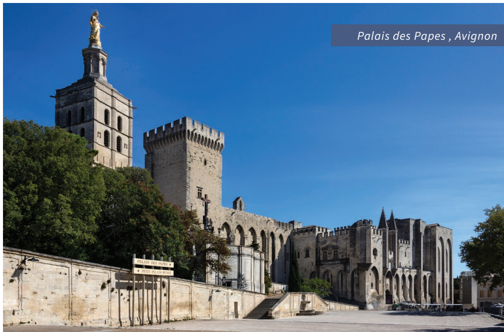
Palais des Papes , Avignon

After breakfast in Arles, we depart for our Included Walking Tour. The city of Arles is a World Heritage Site and boasts a rich history which includes the Gauls, the Romans and the Archbishop of France. This afternoon is free to wander the streets of Arles just as Vincent Van Gogh did in the late 1800’s. In fact, many of the city’s settings may seem