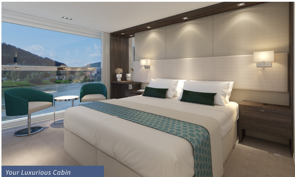
Your Luxurious Cabin

LEGEND: ( ) = Included meal, B = Breakfast, L = Lunch, D = Dinner