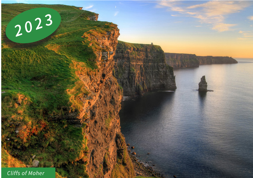
Cliffs of Moher

Fly transatlantic overnight to Ireland. Dinner is served and in-flight entertainment is provided.