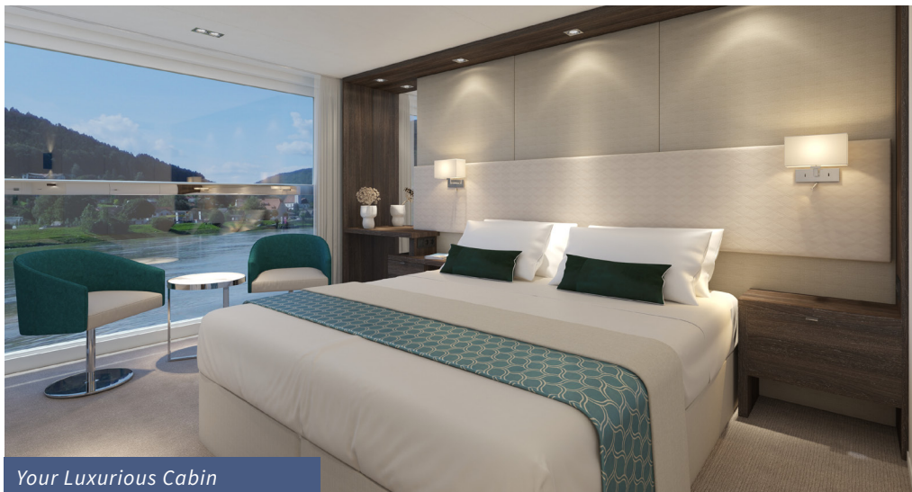
Your Luxurious Cabin

LEGEND: ( ) = Included meal, B = Breakfast, L = Lunch, D = Dinner