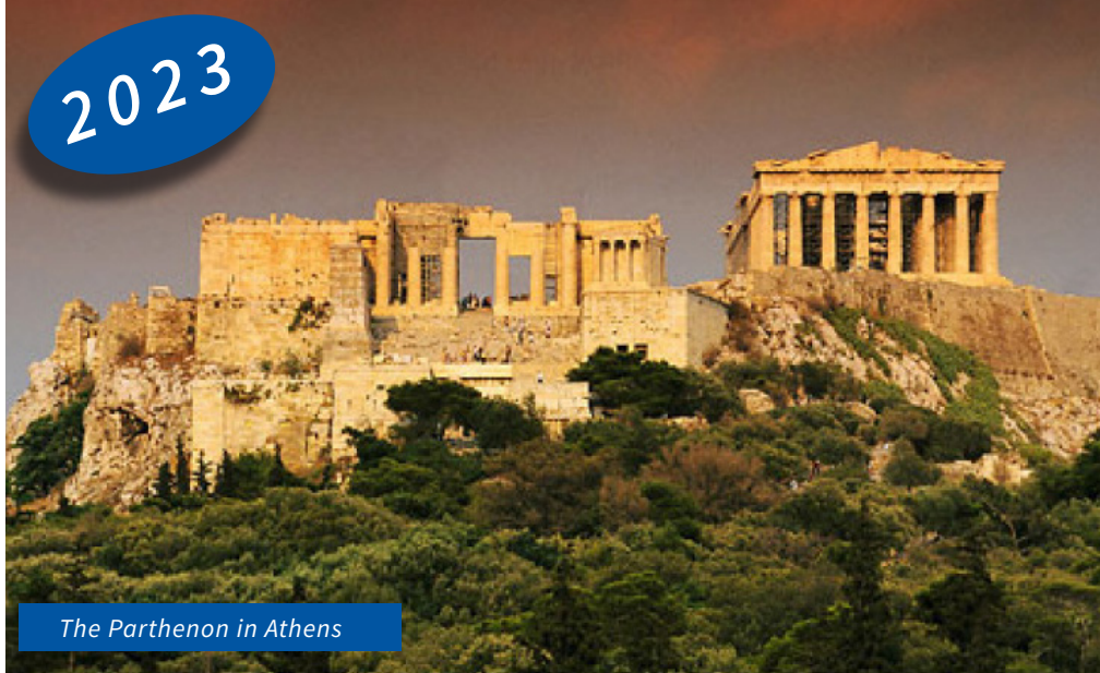
The Parthenon in Athens

Arrive Athens, Greece, a city named after Athena, the Goddess of Wisdom. Meet your tour manager for the transfer to your Saronic Gulf hotel ideally located to enjoy your trip. Enjoy the scenic views as we make the short 1 hour trip through rolling hills to hotel overlooking the crystal blue Aegean Sea. The remainder of the day is at leisure. Relax and take it easy before your welcome dinner tonight. Time to rest or to start exploring the area. (D)